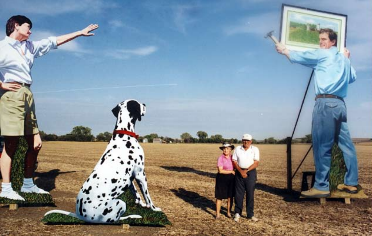
Iowa Landscape, 1997, 16 feet tall, Dunlap, Iowa