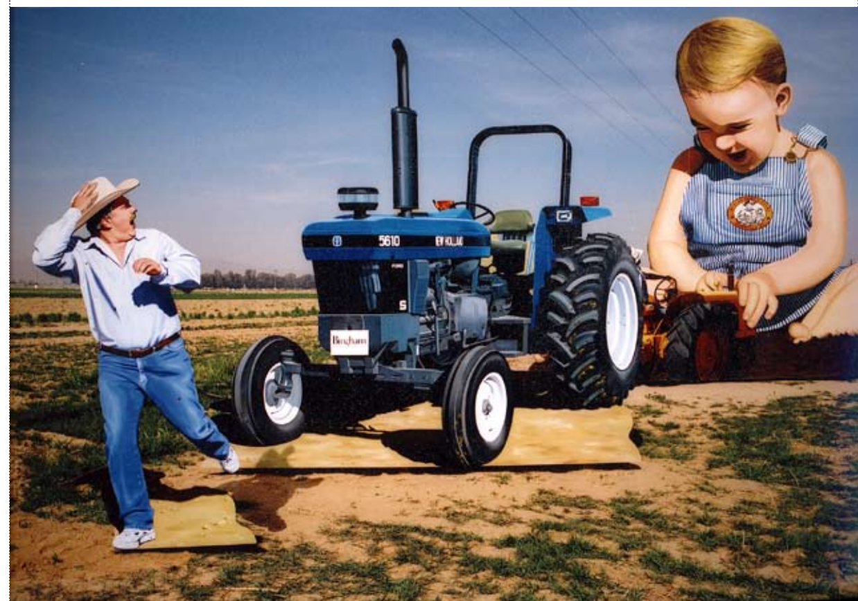
Big Baby with Tractors , 1998, 20 feet tall, Duncan Family Farms, Goodyear, Arizona

This article first appeared in the Winter 2007 issue of Rice Sallyport , The Magazine of Rice University.