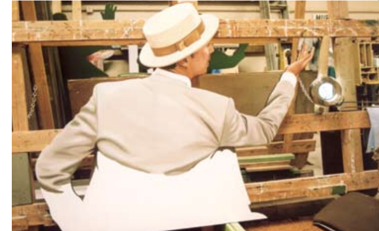
In-process detail of Big Landscape, Big West