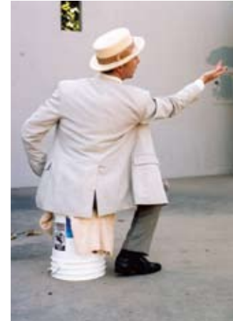
Model posing for Big Landscape, Big West