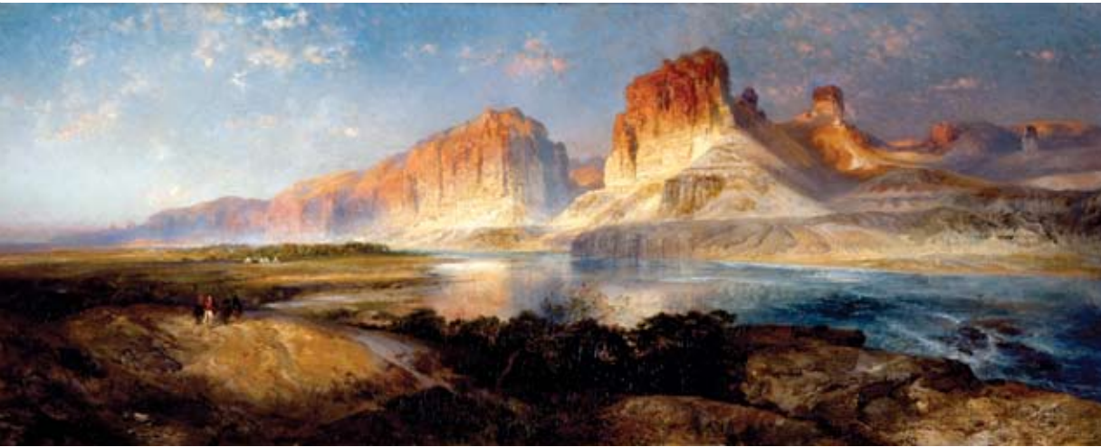
Thomas Moran, Nearing Camp, Evening on the Upper Colorado River, Wyoming, 1882

In their day, Thomas Moran's landscape paintings of the American West were so influential that they helped persuade the United States Congress to declare Yellowstone a national park. In fall 2006, Moran's 1882 masterwork, Nearing Camp, Evening on the Upper Colorado River, Wyoming , served as an inspiration for something a little different: Big Landscape, Big West , an installation at the Rice Gallery by California artist John Cerney.